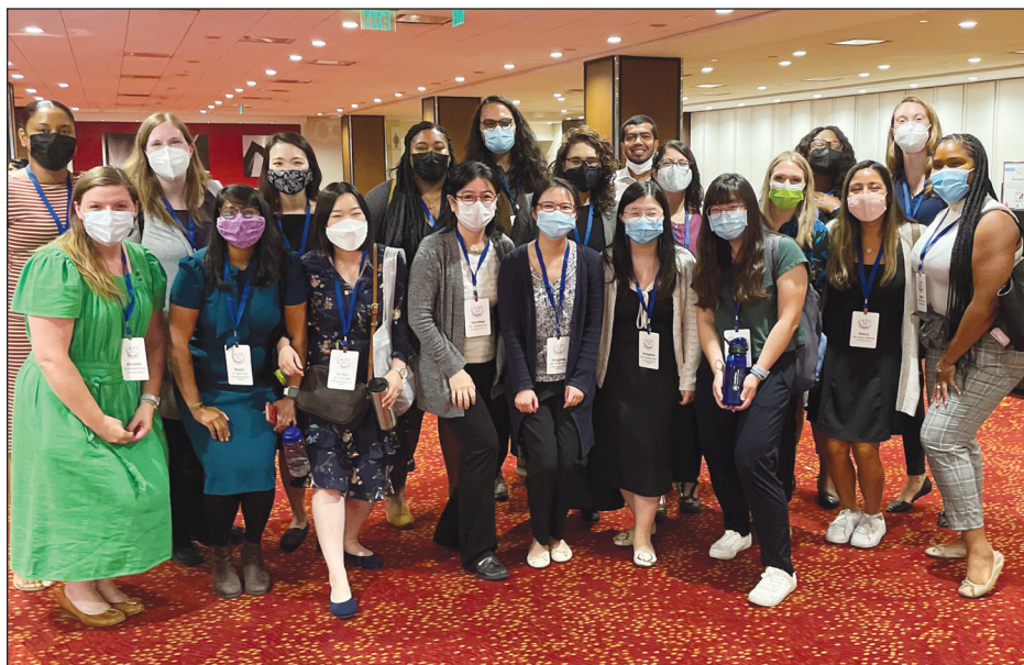
Counselor education faculty and students represented Penn State well at the Association for Counselor Education and Supervision conference in Atlanta.