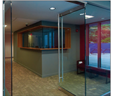
The Edwin L. Herr Clinic

These counselors and supervisors receive weekly, as well as monthly, training and supervision in social justice competencies, liberation psychology and racial trauma counseling.