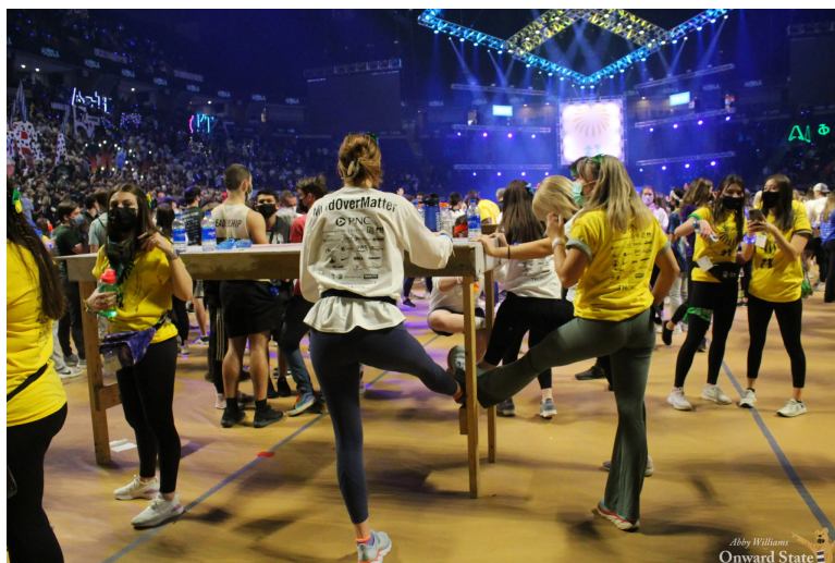
THON dancer stretches with Dancer Relations Committee Member