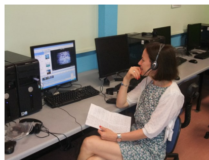
Figure 3: Reviewing and editing the digital story