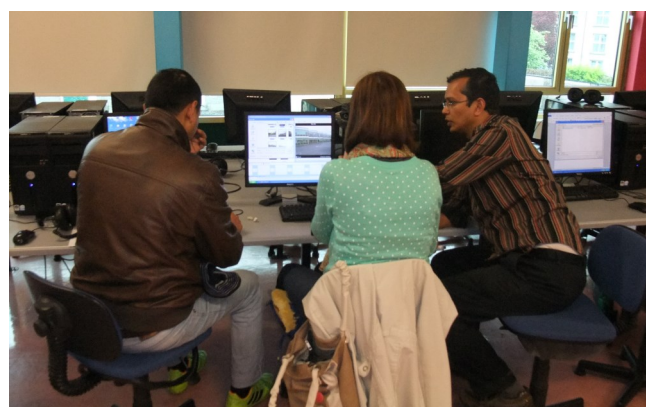
Figure 1: Clare Family Learning Project

The Clare Family Learning Project, a European leader in family literacy, offered a 9-week class on digital storytelling for parents of children at an elementary school in Ennis, Ireland. Parents were encouraged (but not obligated) to involve their children in designing and producing the story. Of the three parents who finished the class, two involved their children in some way, for example, by helping decide which story to tell, locating photos, and recording sounds. In the class, parents first reviewed online examples of digital stories and tools for making them. Using Movie Maker, they created a mock digital story about the school that incorporated photos they took or found online, written text, and other modes. In the remaining class sessions, they created their own digital stories in Movie Maker, with individualized instruction from the teacher. Two parents then presented their stories in one or both of their children's classrooms. These presentations showed the students and teachers that parents were both knowledgeable and lifelong learners, and fostered the parent's and their child's pride in the parent's creative work.